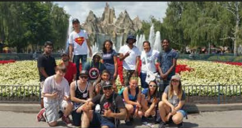
Cooksville crew at Wonderland

I cannot forget all the other lovely student placements, volunteers and youth I had the chance to know during my time at the Dam. Mac and cheese, garlic bread, fresh pastries, loud music, and laughter will forever be symbols of love when thinking of my time at the Dam. Being a part of the Dam, even for a short time, was definitely one of the best things that I have experienced in my professional journey thus far. When someone has the opportunity to grow through serving at The Dam, whatever the role, they will be changed forever and become part of an amazing family; a family filled with LOVE, DIGNITY and RESPECT.