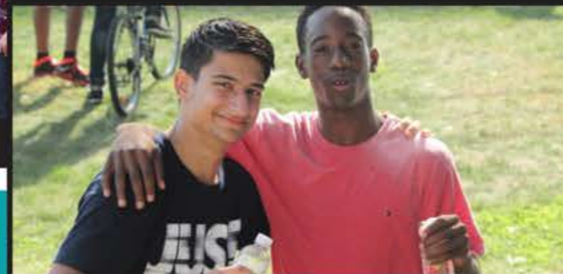
Youth enjoying the sun at our Cooksville location

Check out our new program "While I Still Have Breath" at www.wishb.org or on Instagram - @whileistillhavebreath