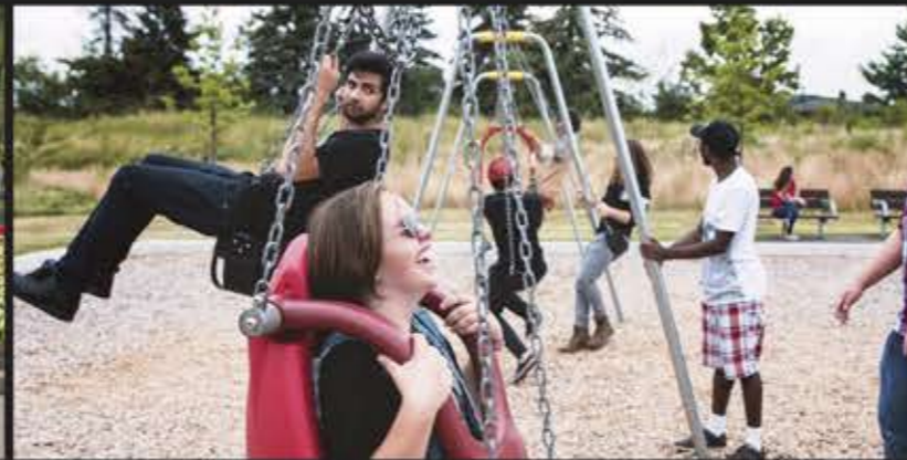
Some swing set fun at the park